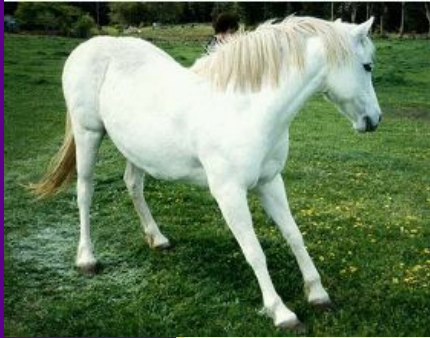
Classic laminitic stance

The warmer weather is almost here. We've had the rain and a spring flush of rich grass is upon us. Take care with any pony or horse that you either know has a previous history of laminitis or maybe at a greater risk, e.g. overweight, out of work or elderly and possibly cushingoid.