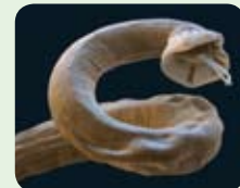
Adult A. vasorum lungworm These live in the heart and pulmonary arteries

Angiostrongylus vasorum can cause a wide range of symptoms – some severe, including coughing, lethargy, fits and blood clotting problems. However other pets may show no obvious signs of problems.